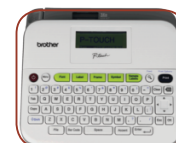
Easy-to-type PC style keyboard