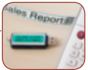
Built-in editable label designs