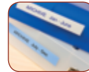
Print labels 3.5 – 18mm in width

With fast print speed and large printing capability, bold, easy-to-read labels can be printed.