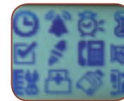
14 fonts, 99 frames Over 600 symbols