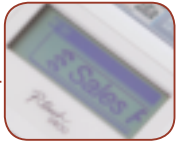
Graphic display with Print preview