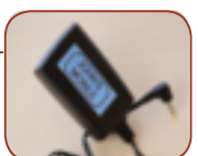
Uses 6 x AA batteries* or bundled AC adapter